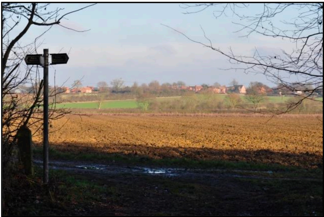
framed by trees.

And one of the Distinctive Views ( Appendix 2, View 4)